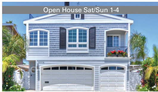
Open House Sat/Sun 1-4

Newport Beach 5004 River Ave $1,999,000 Nicolai Glazer 949.306.8339