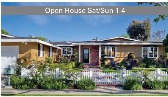
Open House Sat/Sun 1-4