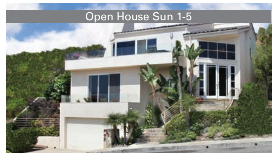
Open House Sun 1-5